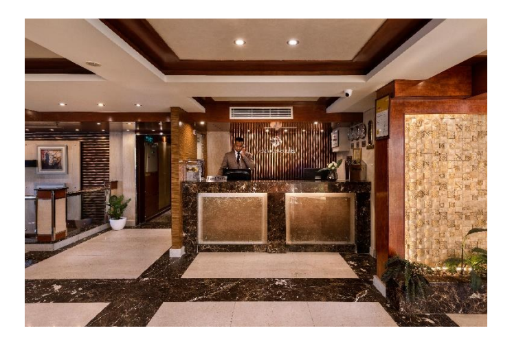
Enjoy the Nile in an Ancient way, with the Comfort of Today

Esmeralda Nile Cruise presents you with a luxurious experience. Sailing through 7000 years of civilization, the cruise takes you along the magical Pharaonic scenery from Luxor to Aswan, savoring the taste and feel of ancient Egypt. Enjoy free WiFi, room service & Non-smoking rooms.